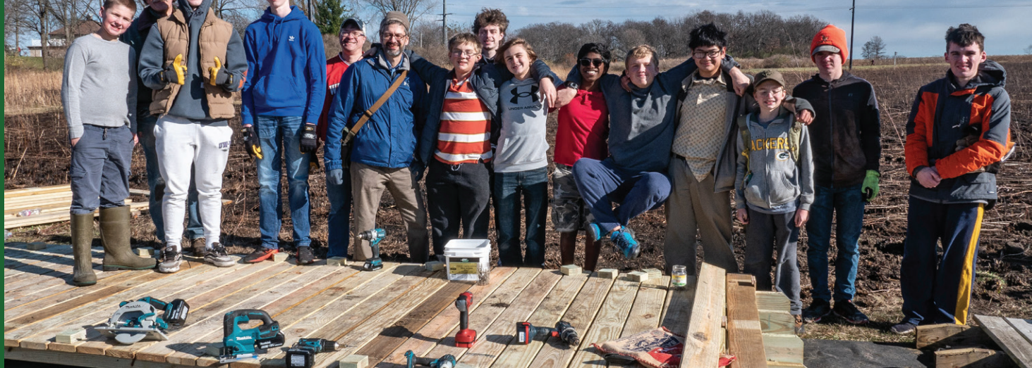
Scouts and volunteers help build a boardwalk extension