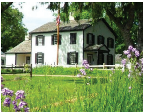
Historic Indian Agency House

Celebrate Groundswell's 40th anniversary this summer with a free community field trip. Reserve your spot today at groundswellconservancy.org/events .