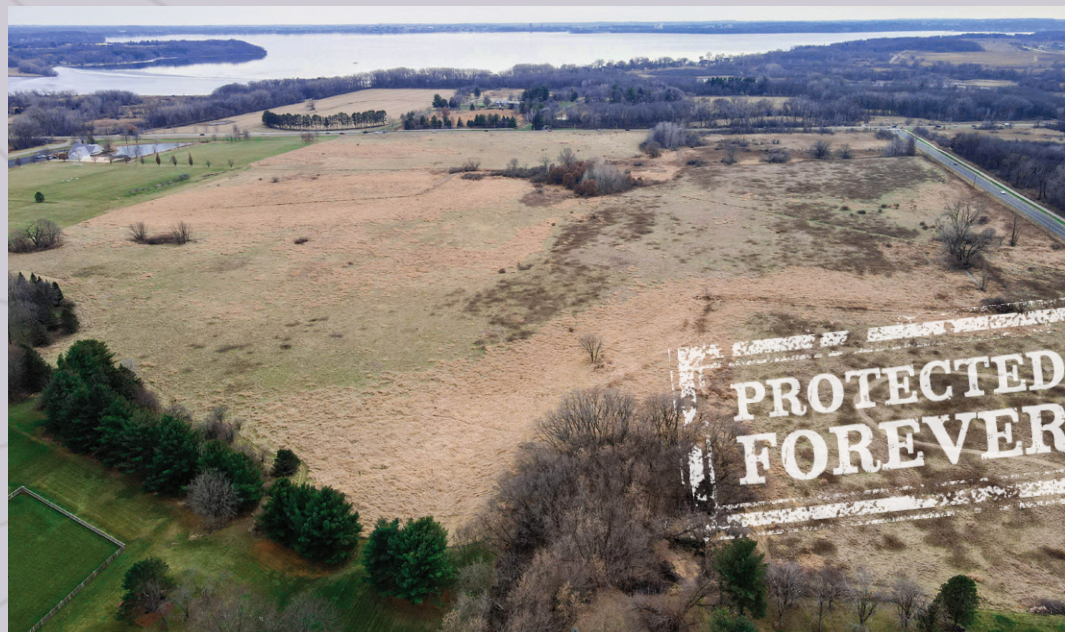
Birds-eye view of purchase on the corner of County M and Woodland Drive.