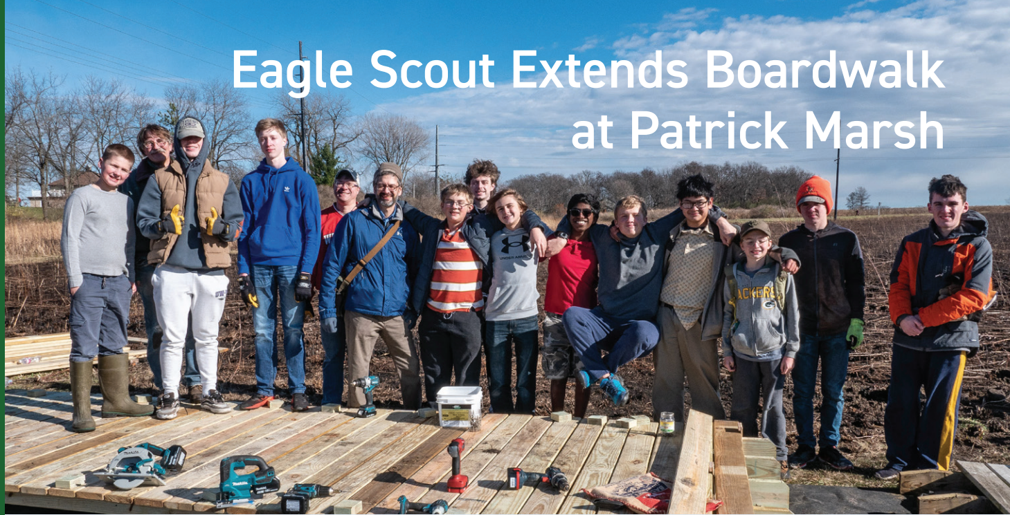
Scouts and volunteers help build a boardwalk extension