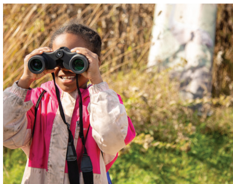
Focal Flame Photography