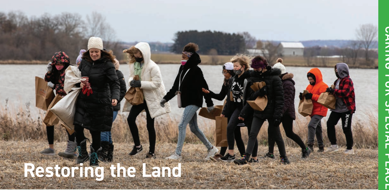
Patrick Marsh Middle School helped plant 25 acres of prairie at Patrick Marsh