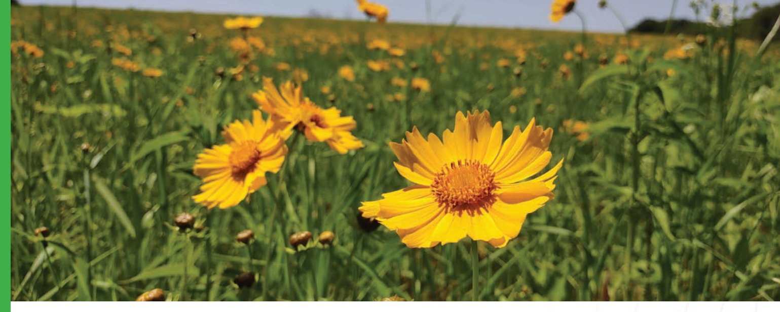
A field of prairie coreopsis on one of our conservation easements