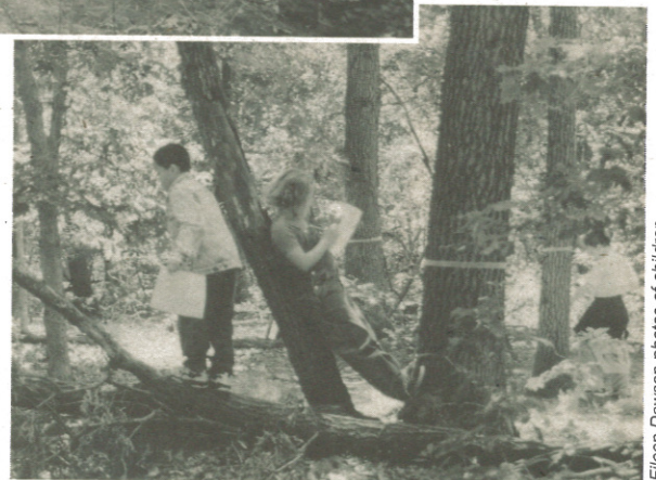
Eileen Dawson photos of children

These students have each adopted a tree, and are writing about it. Their class visits the forest at least once a month.