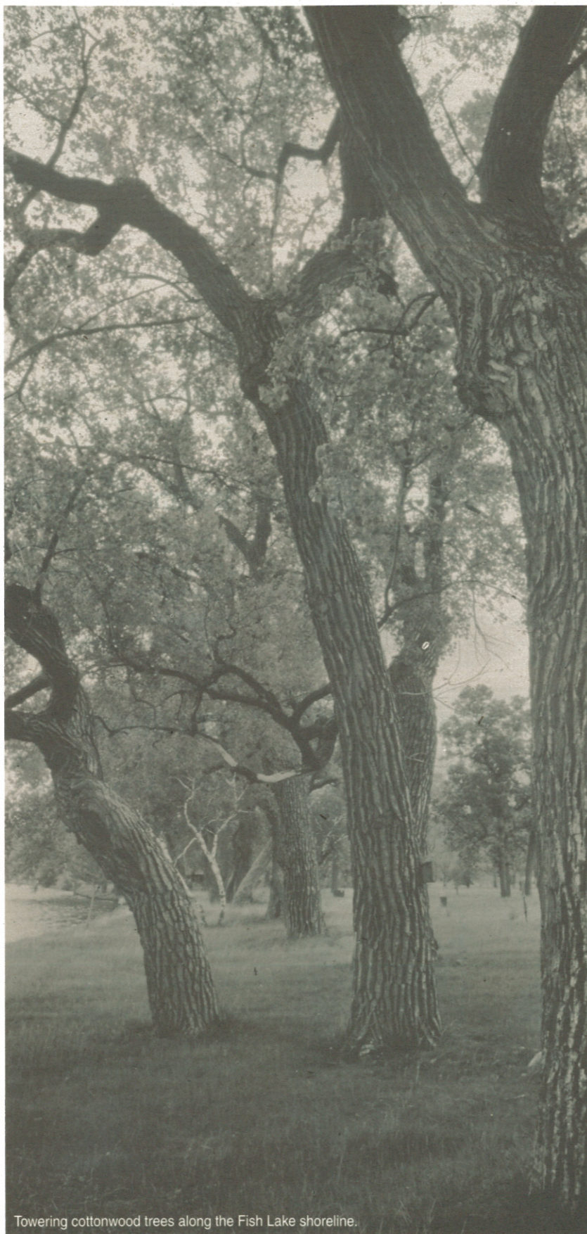
Towering cottonwood trees along the Fish Lake shoreline.