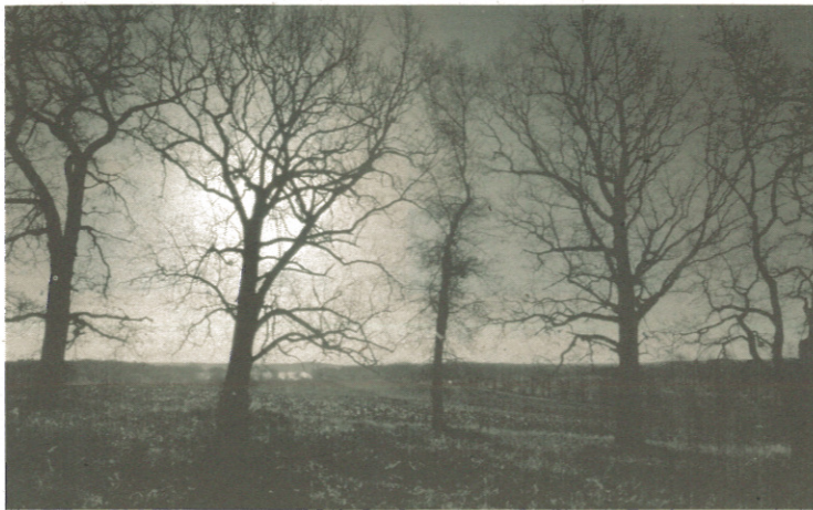
Scene at the Sinaiko property.

But did you know that there are also long-term ways for you to help preserve and protect natural areas in and around Dane County? Those of you who are planning your financial future can continue your commitment to conservation for coming generations by including the Dane County Natural Heritage Foundation in your will or estate plan. So doing makes a statement about your sense of stewardship and what our organization's work has meant to you across the years.