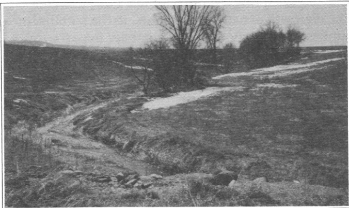
A northern tributary of Token Creek

Most farmers also had Holstein cows. Milking was done by hand and later with the help of automatic milking machines. Farm wives scrubbed the dairy equipment daily in case the milk inspector appeared. Infractions could cause milk from that farm to be refused. Some farmers carried their own milk cans to the cheese factory which had been built in the Token Creek area in 1911. It was located at the intersection of Portage Road and Rattman Road and operated until November 17, 1956.