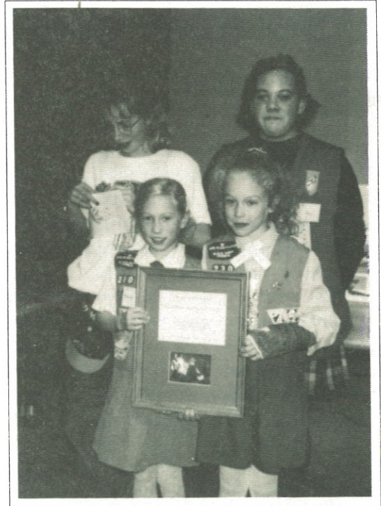
Black Hawk Council Girl Scout receiving the Youth Stewardship Award