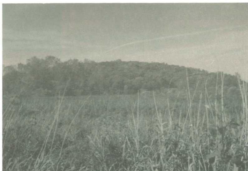
The Big Hill sits at the intersection of Portage Road and Hwy 19

In the center of the Token Creek watershed sits the "Big Hill". The hill was formed when the last glacier left 150 feet of rock and gravel in a pile as the ice melted. As the tallest landform around, the hill has provided guidance to travelers since human occupation. The hill marked Native American hunting camps along the creek. It provided a place where Civil War soldiers practiced riflery. It has served as a one-room school site, a ski jump location and a hunting area. Now, the western, undeveloped half of the hill has been donated to the Deforest School