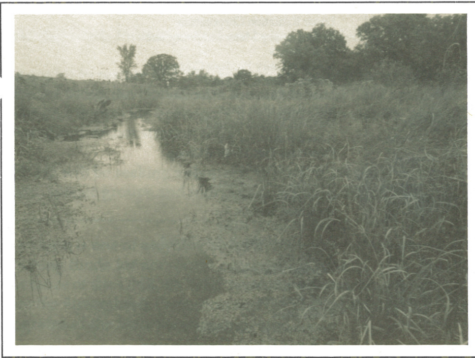
Story Creek in southeastern Dane County

Chuck contacted the DCNHF office last summer expressing interest in the conservation easement program. Two members of the Stewardship Committee visited the property and reported that a substantial part of it had been maintained a relatively natural state. His efforts to preserve and maintain the ecological and aesthetic