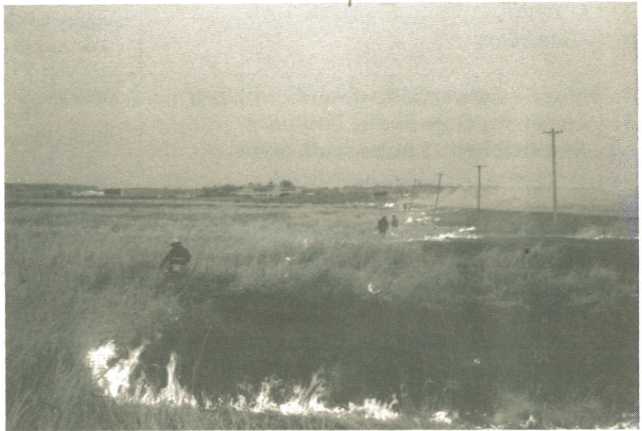
The Waunakee Volunteer Fire Department burning the wetland area on the Wilke Prairie Preserve, April 4, 1994