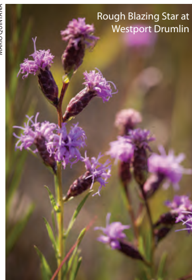
Rough Blazing Star at Westport Drumlin