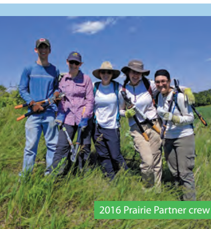
2016 Prairie Partner crew

Westport Drumlin on the north side of Lake Mendota is being maintained because of a shared Prairie Partners intern crew and their generous sponsors. We all are fortunate to partner our support with Natural Heritage Land Trust in holding and maintaining in perpetuity this special part of our natural land history.