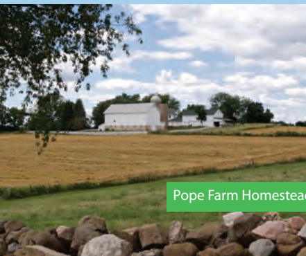
Pope Farm Homestead

We are pleased to support Natural Heritage Land Trust with our donation and as part of our estate planning because we believe in the importance of its mission to protect the natural beauty of our land and water. The Land Trust may focus on Dane County, but our land and water is connected to the rest of the state which makes our support, in Dane County, a value-added legacy.