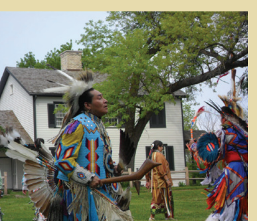
Agency House was the meeting point for Native American and European cultures when Wisconsin was on the frontier of the United States 182 years ago.

Historic Indian Agency House We preserved a significant piece of Wisconsin history in Portage by placing a permanent conservation easement on the 160 acre landscape surrounding the Historic Indian Agency House owned by The National Society of The Colonial Dames of America in the State of Wisconsin. The Agency House and surrounding land is adjacent to the historic portage between the Fox and Wisconsin Rivers and helps tell the story of Wisconsin's frontier past. At the same time Natural Heritage Land Trust purchased the conservation easement, the Ice Age Trail Alliance purchased 46 acres from the Colonial Dames to secure a portion of the Ice Age Trail along the Portage Canal.