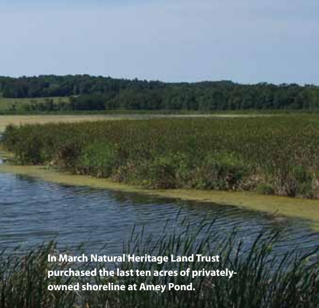
In March Natural Heritage Land Trust purchased the last ten acres of privately-owned shoreline at Amey Pond.