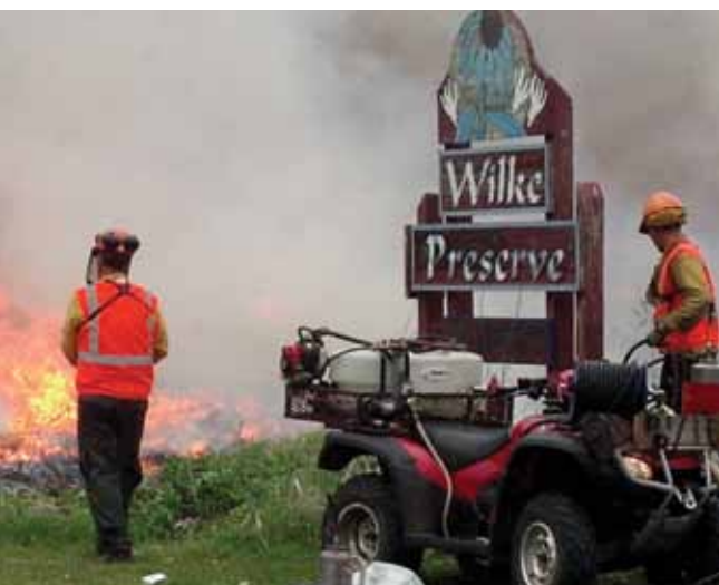
Quercus Land Stewardship Services performed a prescribed burn at Wilke Prairie Preserve just north of Waunakee on April 7, 2012.