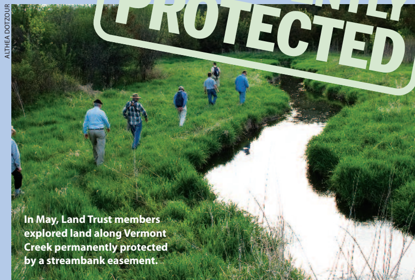
In May, Land Trust members explored land along Vermont Creek permanently protected by a streambank easement.

This year the Natural Heritage Land Trust completed nine land protection projects, permanently protecting 787 acres at cherished places in the Dane County region. Most of these projects are at places where we have spent years working with landowners and partners to conserve important natural resources. For example, please see our cover story about our work in the Black Earth Creek valley , where we completed two streambank easements and one scenic easement; these are our 6th, 7th, and 8th projects in the valley.